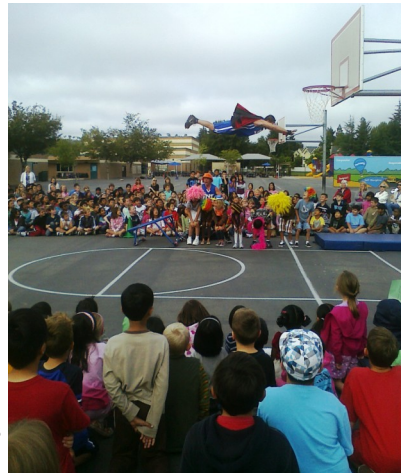
Now that's character!

Friday, September 17th was an assembly the students at Fairlands will likely not forget any time soon! Fairlands PTA sponsored the TNT Dunk Squad who have been seen at all NBA Team halftime shows, the NBA All Star Game, the Atlanta Olympics, NCAA Final Four Game and Disneyland. Throughout their 2 decade act, they have been featured on numerous TV shows both nationally and internationally. It as a real treat to be able to have them perform for our students and give them a positive message.