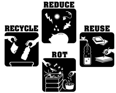
Fairlands utilizes the 4 R efforts throughout the year.

TEAM PAGE for details on the various volunteer Opportunities. Contact our GREEN TEAM CO-CHAIRS for details.